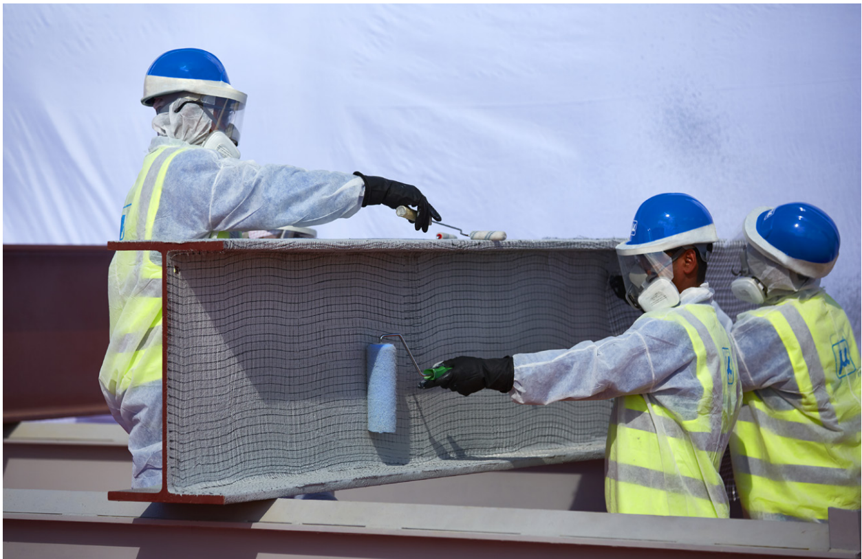
Application of passive fire protection on steel beams

For more information about additional opportunities and risks, please see our detailed explanations in the 2016 Annual Report.