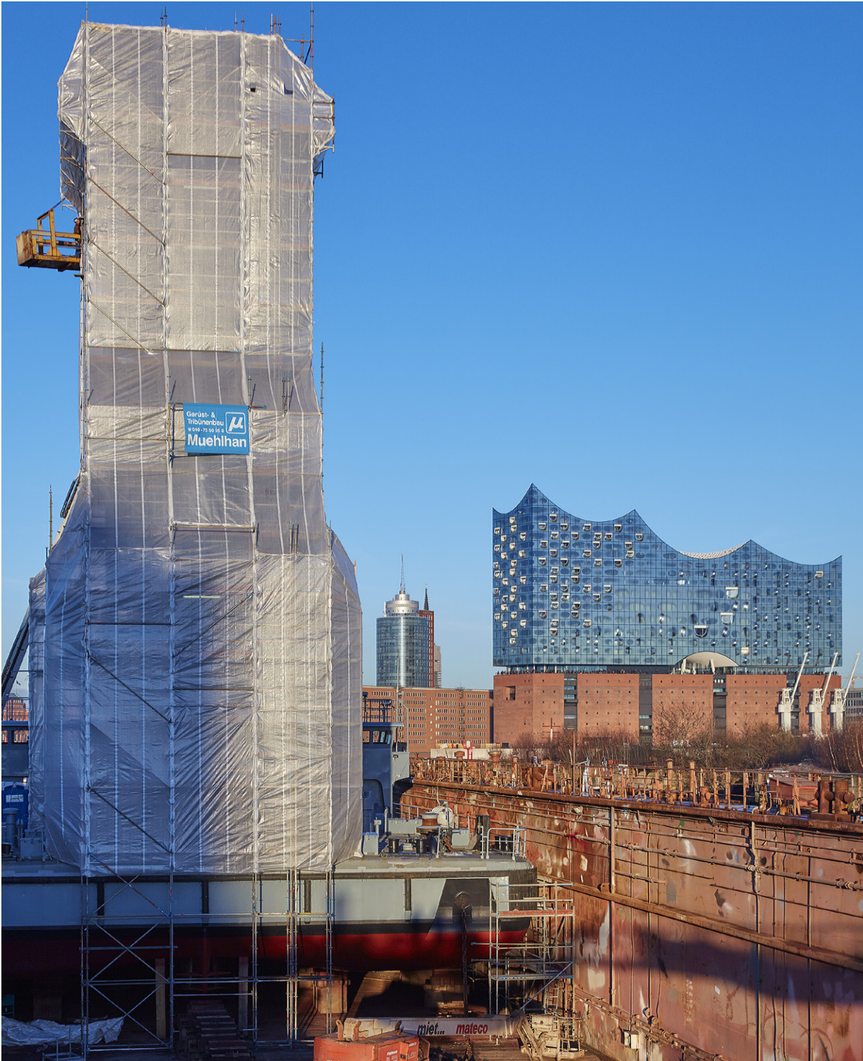
Taskforce supply ship "Berlin" of the German Navy, Hamburg